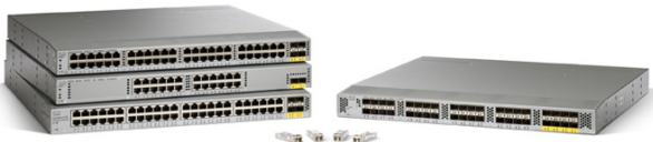
Figure 1. Cisco Nexus 2148T, 2248TP, 2224TP, and 2232PP Fabric Extenders

The Cisco Nexus 2000 Series connects to a parent Cisco Nexus switch through fabric links using CX1 copper cable, short-reach or long-reach optics, and the cost-effective Cisco Fabric Extender Transceivers (FET). The complete range of Cisco Nexus 2000 Series products can connect to parent Cisco Nexus 5000 Series Switches to support large-scale Gigabit Ethernet and 10 Gigabit Ethernet environments over a unified lossless fabric.