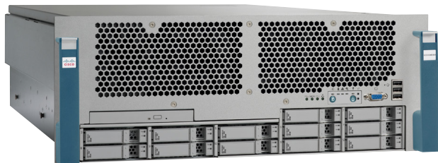
Figure 2. The Cisco UCS C460 M1 High-Performance Server

Cisco's prior record-setting VMmark benchmark result with the Cisco UCS B250 M1 Extended Memory Blade Server demonstrated how the architectural attributes of the Cisco Unified Computing System contribute to performance, including a low-latency 10-Gbps unified network fabric that carries both IP and storage traffic at the rack level, Cisco Extended Memory Technology that provides the largest memory footprint available in any two-socket server, and Cisco UCS M81KR Virtual Interface Cards (VICs) that allow virtual machines to connect directly to Ethernet network interface cards (NICs), making them capable of achieving up to 30 percent greater network performance while offloading the host CPU from emulating a switch. Cisco VICs provide a hardware implementation of Cisco VN-Link technology that gives visibility, security, and quality-of-service (QoS) management to network links connecting directly to virtual machines.