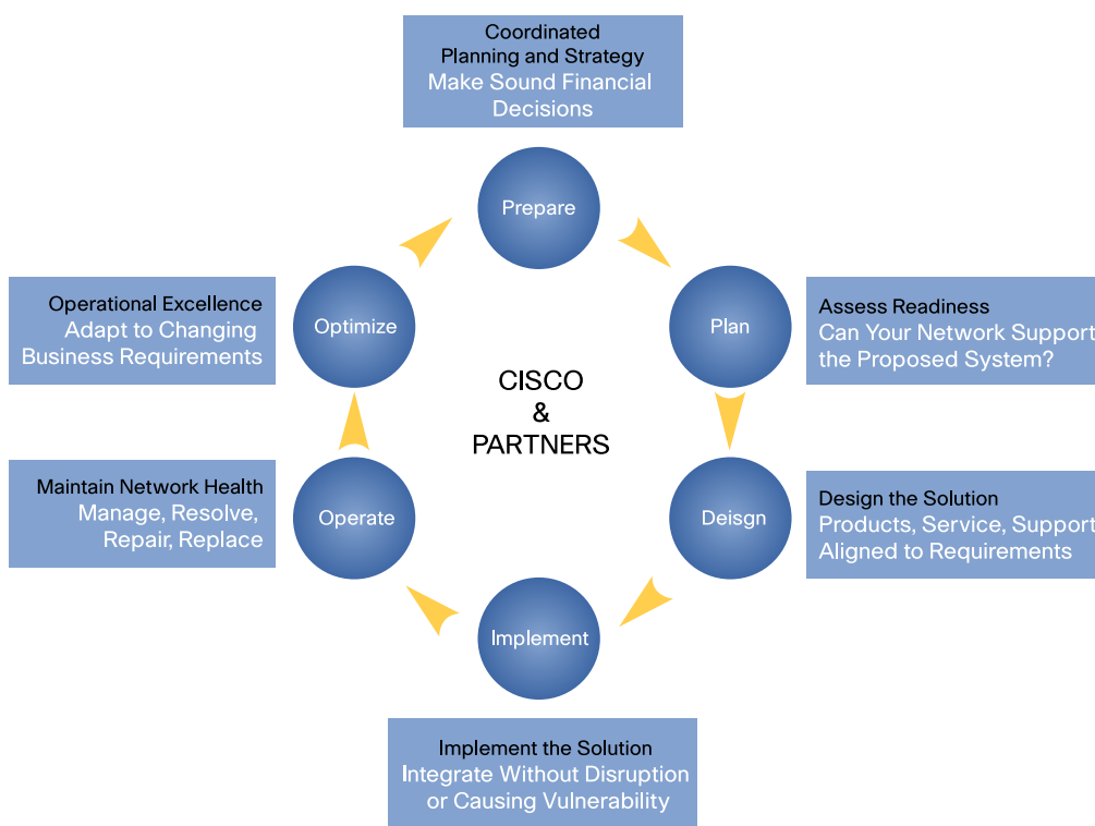
Figure 1. Network Lifecycle

Cisco Services for IPv6 are mapped to this same network lifecycle, creating a framework for IPv6 integration activities and deliverables that best meet the customer’s needs for cost savings, risk mitigation, and time to completion. The IPv6 service activities are shown in Figure 2.