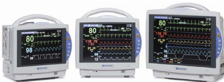
Figure 1. Nihon Kohden TR-6000 Series Monitors

The TR-6000 Series gets its name from the concept of Total Recall - it's the only line of fully featured bedside monitors that retain the patient's monitored data consistently throughout the product line and under most conditions, during transport. The system consists of a data acquisition unit that uses Nihon Kohden Smart Modular Cables and sensors, and three display options.