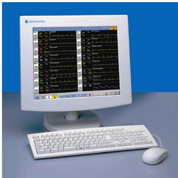
Figure 2. Nihon Kohden CMIS

Nihon Kohden's direct-access clinical monitoring information system, empowers the clinician to review and document all patient monitoring information with a few simple keystrokes.